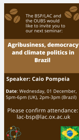
BSP Poster Coffee & Science Series